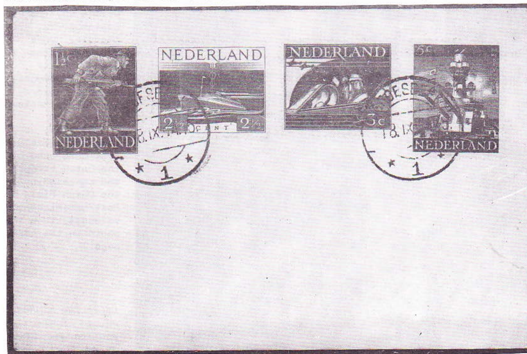
One of the two covers canceled at Groesbeek on September 18, 1944 at 3 p.m.

The 82nd Airborne's first task was to secure the bridge at Grave (see map above), where the Maas River was crossed. As you can see from the map which was adapted from Ryan's book, major drop zones were near