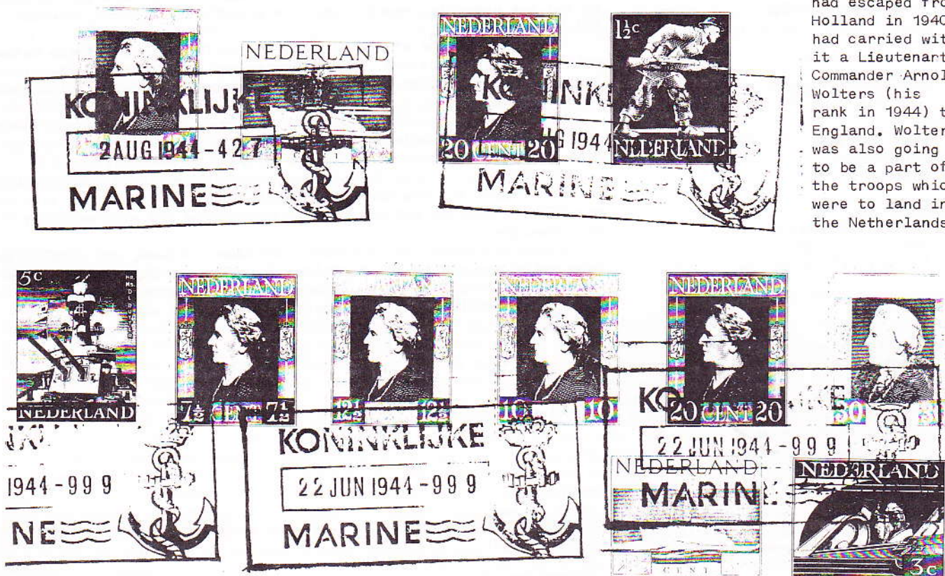
Examples of the use of the "liberation set" on board ships of the Netherlands Navy

sweepers which had escaped from Holland in 1940 had carried with it a Lieutenant Commander Arnold Wolters (his rank in 1944) to England. Wolters was also going to be a part of the troops which were to land in the Netherlands.